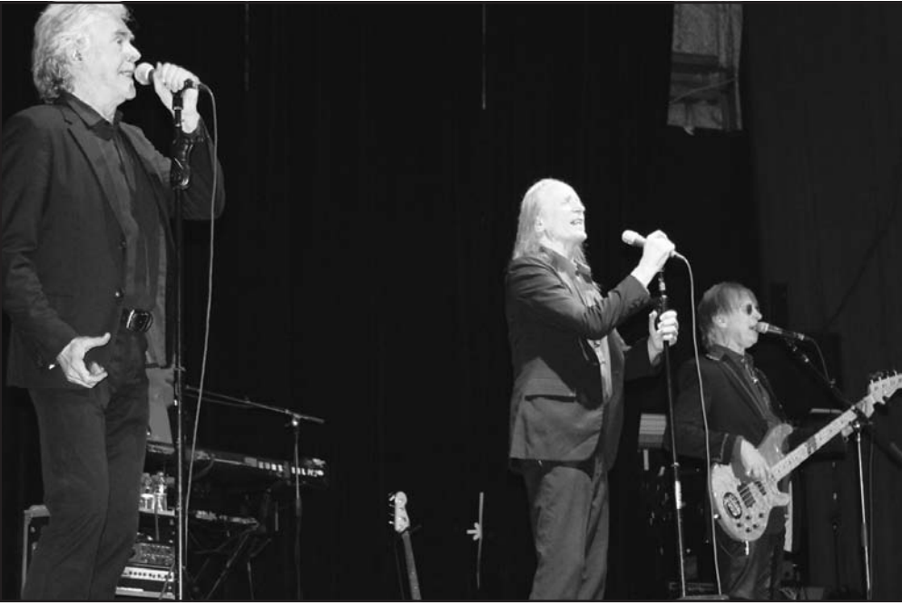
Three Dog Night performing at the Fairgrounds in 2015 – they will return in 2019.

"Get your tickets early and make your camping reservations early," said Thomason. "We're going to begin Jan. 2 making camping reservations for 2019 for the fairs and festivals and the holiday weekends. If you want to camp, remember Jan. 2."